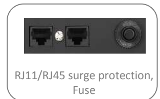
RJ11/RJ45 surge protection, Fuse